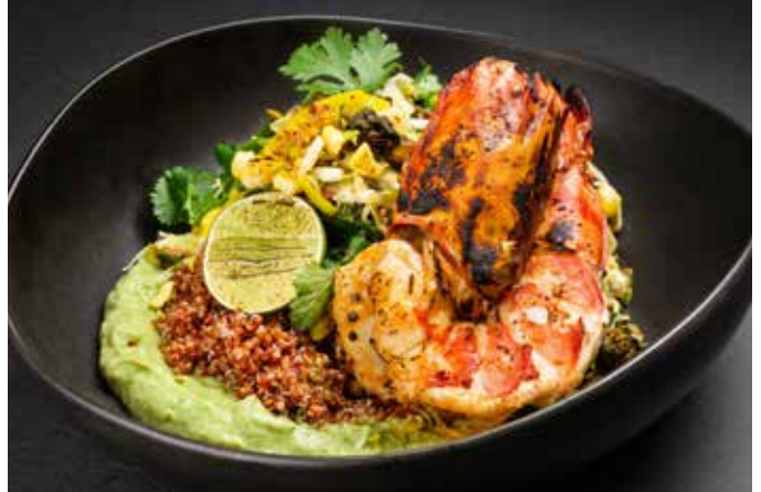
Mexican Jumbo Tiger Prawn 590

Grilled slow-cooked chicken breast stuffed with lemon butter herbs. Served with quinoa salad, cherry tomatoes, red onion pickle, toasted pine nuts, grilled zucchini, fresh herbs, toasted pistachio and lemon, beef-yogurt sauce and turmeric pickled onion. Topped with Zhoug sauce, Urfa chili, coriander and sliced red onion