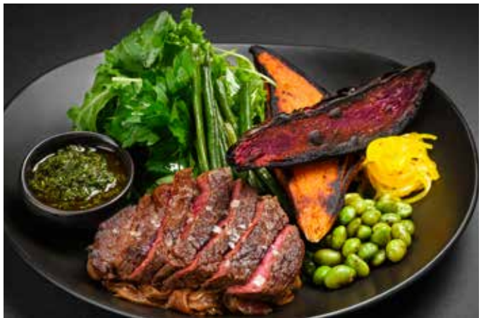
Beef Tenderloin 990

Spice-rubbed Australian lamb shoulder chops served with flageolet beans mixed with stir fried baby kale, grilled broccolini, baby carrots, tzatziki dipping sauce and Maldon smoked salt