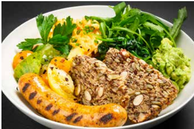
Scrambled Bowl 590

Zucchini blossom fritters with Parmesan and feta cheese on avocado and herbs cream puree. Served with charred corn salsa confit sun gold tomatoes. Topped with poached egg, chilis and fresh coriander