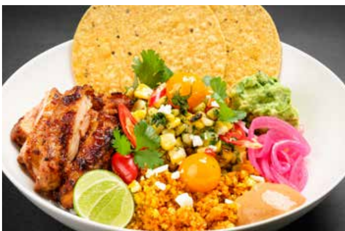
Adobo Chicken & Cauliflower Rice 490

Jasper-grilled vegetables with parsley and mint lemon dressing, baby rocket salad, baby kale, keto nut crisps and avocado cream sauce