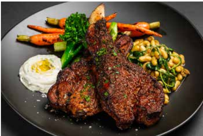
Lamb Chops 990

Grilled spicy jumbo prawn served with charred corn salsa, spring onion, okra, cabbage, red quinoa, red onion pickled, pistachio, pumpkin seed, lime and avocado sauce