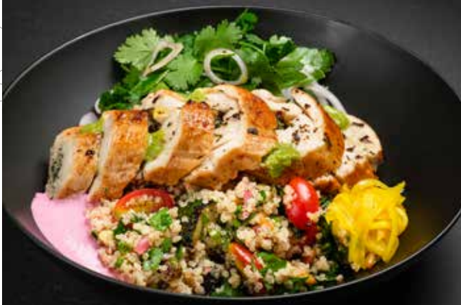
Lemon & Herb Stuffed Chicken 590